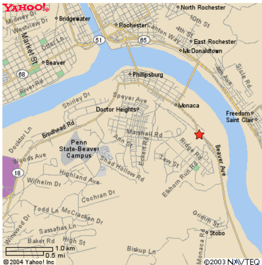
(Maps courtesy of www.maps.yahoo.com )